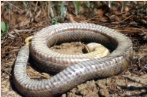
Eastern hognose playing dead.

It is the defensive behaviors of eastern and southern hognose snakes that give rise to the stories we hear. When frightened, hognose snakes instinctively coil, flatten their heads and necks, and hiss. In fact, many people call the snakes “spreading adders” or “hissing vipers.” If this impressive display is not enough to scare away most intruders, hognose snakes have another trick—they roll over and play dead. The act can be so convincing, with convulsions and writhing and vomit and sometimes blood, that even people who know the snakes can do this still think the snake has died. The true test is to put the snake back on its stomach. . . it will immediately flip back over to appear “dead.” We said the snakes have neat behaviors—we didn’t say they were smart.